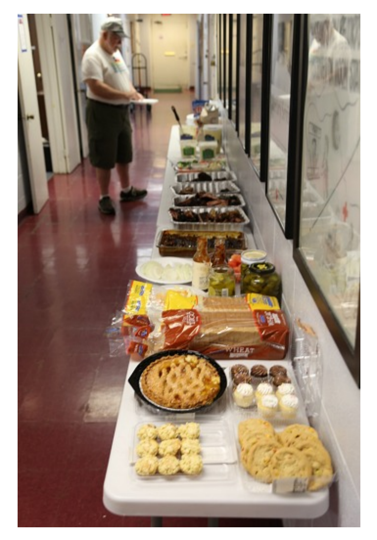
Where is everyone?