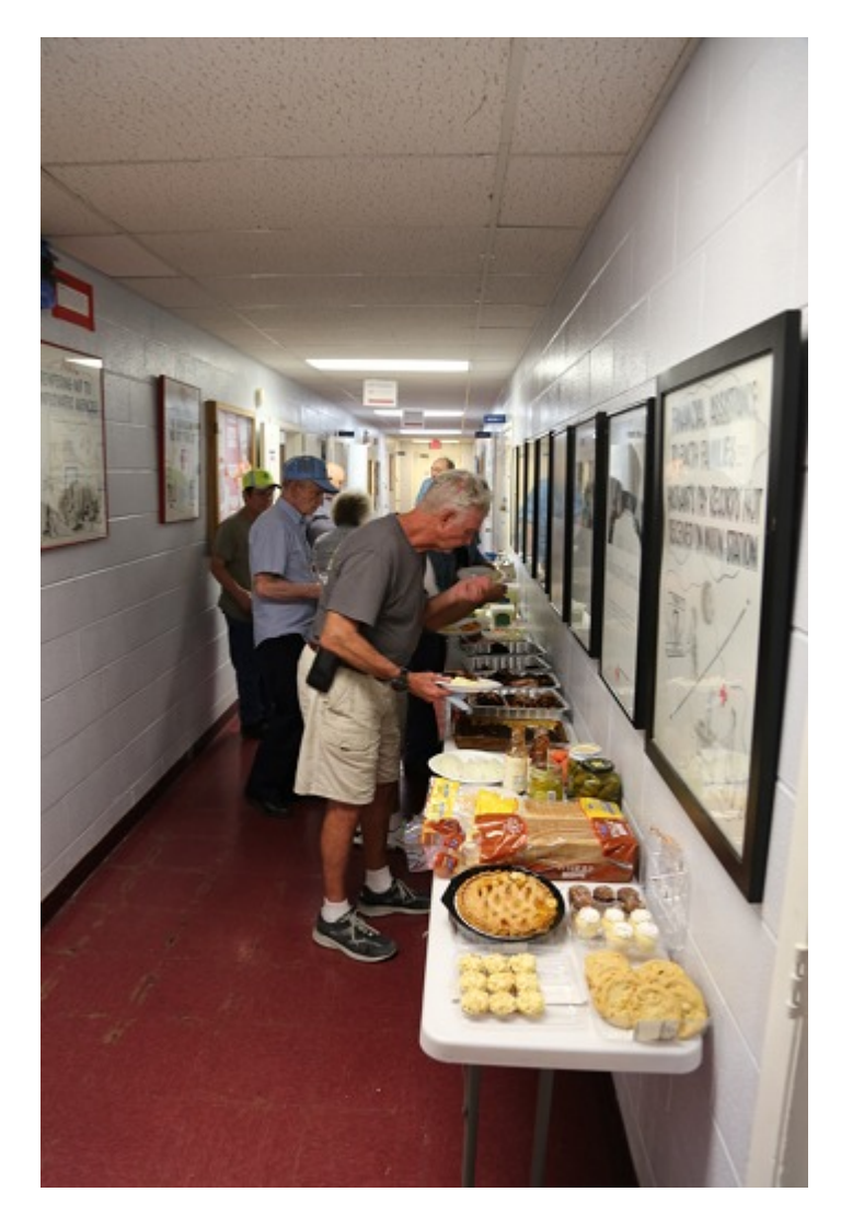
There they are. If you cook it, they will come!